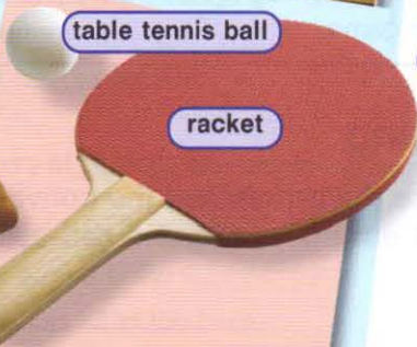
table tennis ball