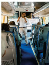
a tour guide