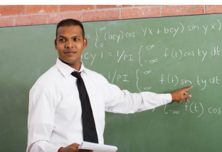
mathematics / math